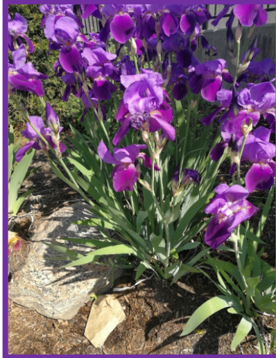
Circa 2018, St.Michael's College Garden/Bathurst Street Site/Toronto. (Parent Alumni)

The purple Irises represent, historically and still TODAY in modern times, royalty first and foremost. Then, the upright petals symbolize: WISDOM, FAITH AND BRAVERY . How suitable it could become the floral emblem for the Faith Community Nurses!!