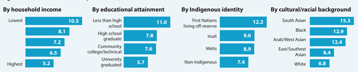
Figure 1: Chronic diseases disproportionately impact groups that experience systemic social and economic disadvantages (all types of diabetes)<sup>1</sup>

Age-standardized rates, self-reported data, CCHS 2015–2018