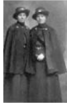
Milton's Nursing Sisters Great War of 1914-1919

The Milton historical society website has sourced information regarding Milton nurses during the Great War of 1914 - 1919 (First World War). The information on these nurses was published in a book called: Milton Remembers WWI and Men and Women We Never Knew .