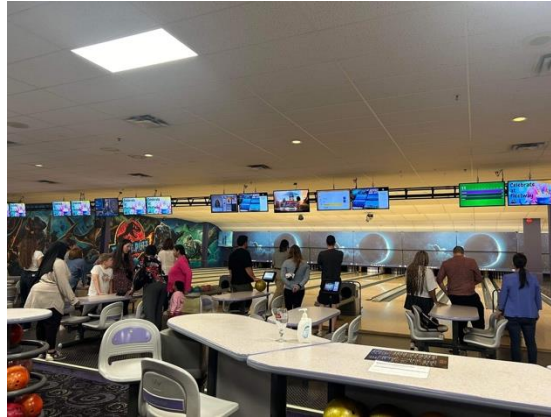
Members, family, and friends of the Middlesex-Elgin chapter enjoying bowling at Fleetway.

was filled with fun as members enjoyed refreshments and pizza and caught up with other members while meeting new members!