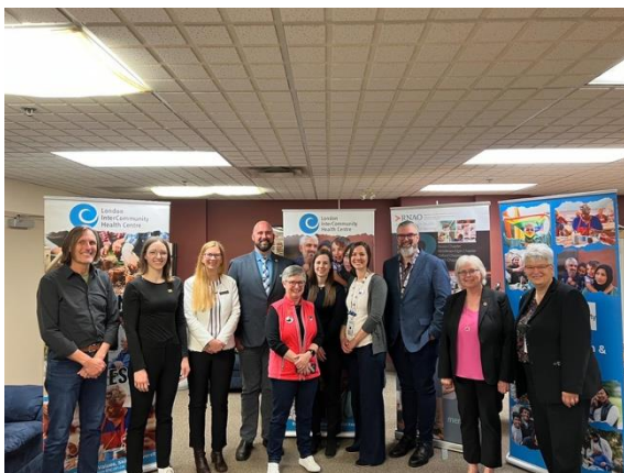
Members of the Middlesex-Elgin Chapter with our MPP representatives and employees of the London Intercommunity Health Centre pictured following a tour of the HOME bus and program initiatives.