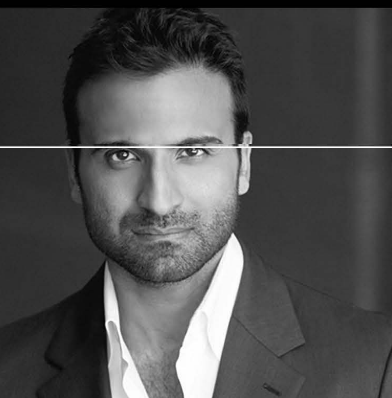
Huse Madhavji Actor, Writer, TV Personality