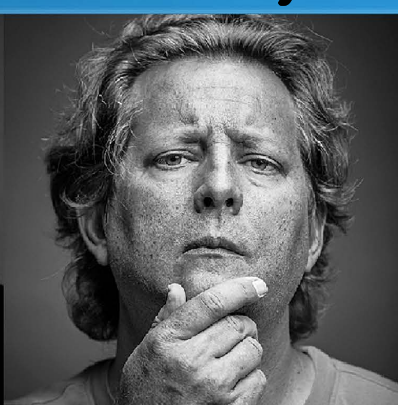
Alan Cross Legendary Radio Host