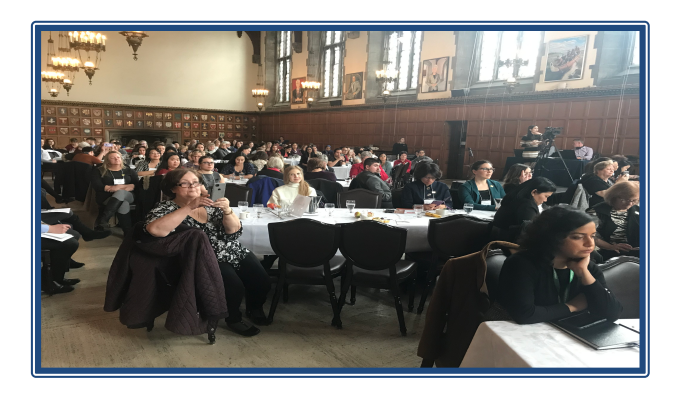
Queen's Park Day afternoon presentations at Hart House, U of T.